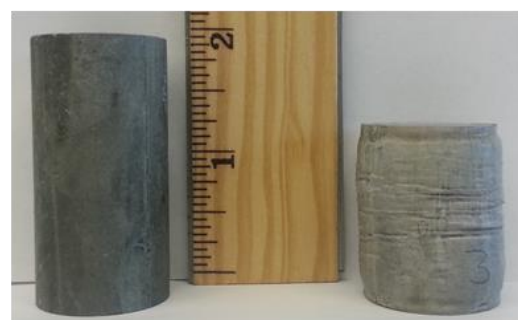
Cement + 1% additive